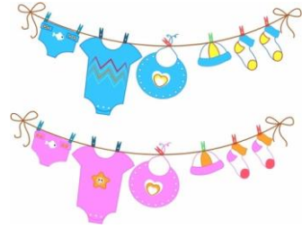
Clothes for you and the baby